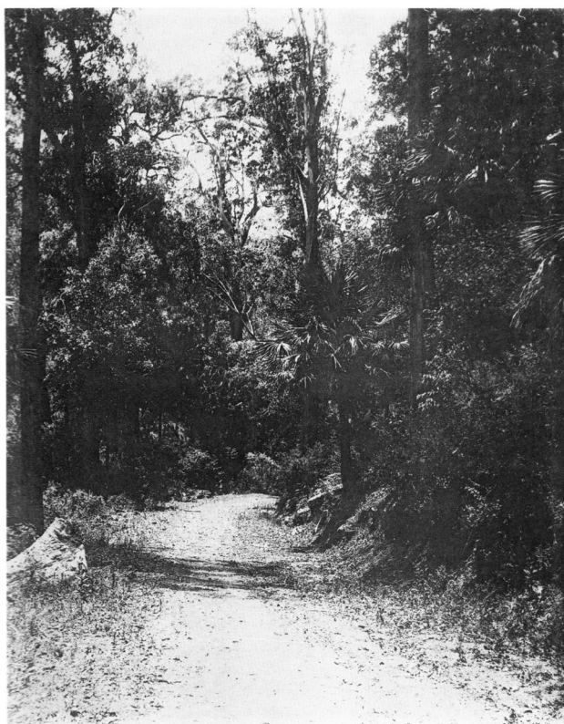
LADY CARRINGTON ROAD.

A second period identified by Dunphy involved the extraction of timber from the Bottle Forest and Forest Ridge areas near Heathcote to supply the wood fuel used for the starting up of coal-burning furnaces on the trains of the Illawarra railway line. Dunphy believed that cutting of Eucalyptus species for this purpose, combined with the sparing of the Sydney Red Gums ( Angophora costata ), resulted in the conversion of this forest into an open forest of Sydney Red Gums. There is no record of these operations in the Trustee reports for the period.